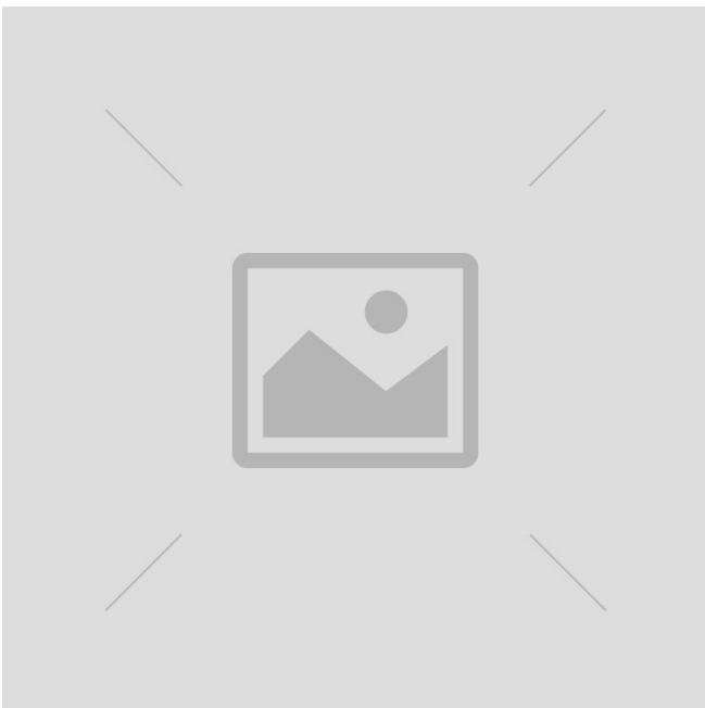
Switch and power location image