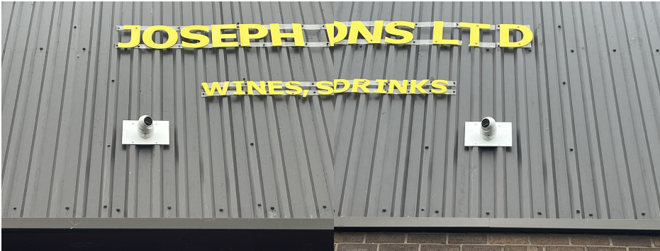
Camera Location Image 2