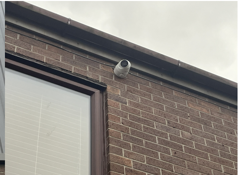
Camera Location Image 3