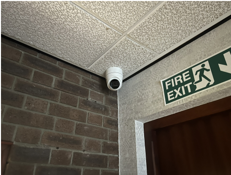
Camera Location Image 4