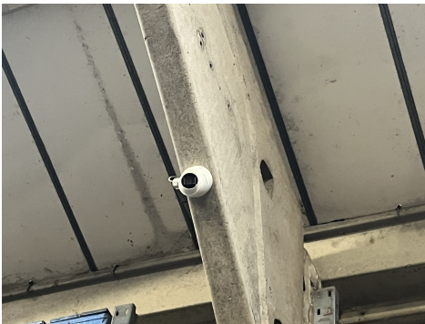
Work Image 4