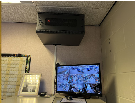
Work Image 2