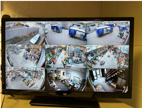
Work Image 1