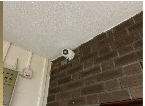
Work Image 3