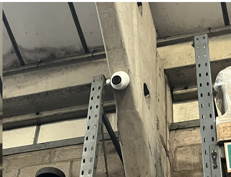
Work Image 5