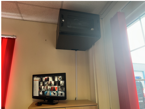
Work Image 1