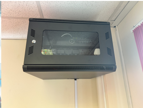
Work Image 2