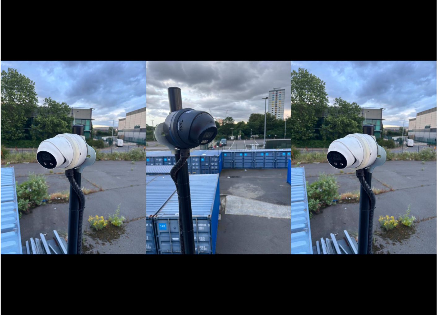
Work Image 6