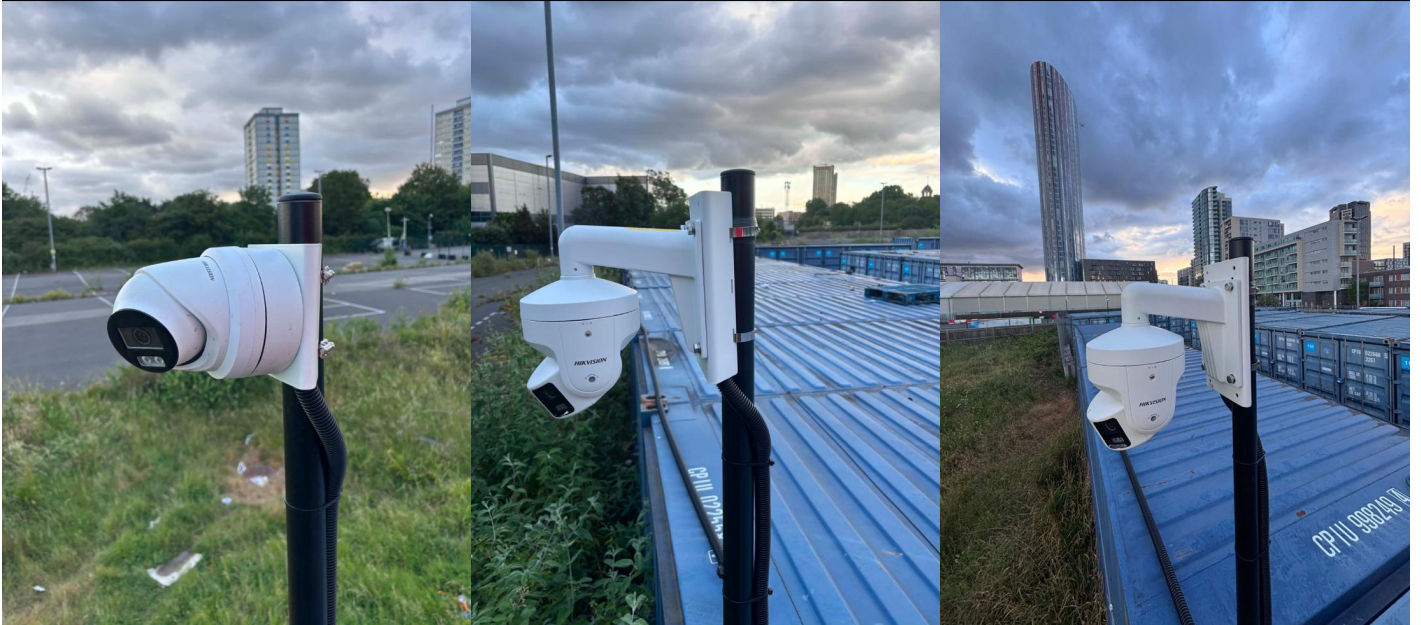
Camera Location Image 3