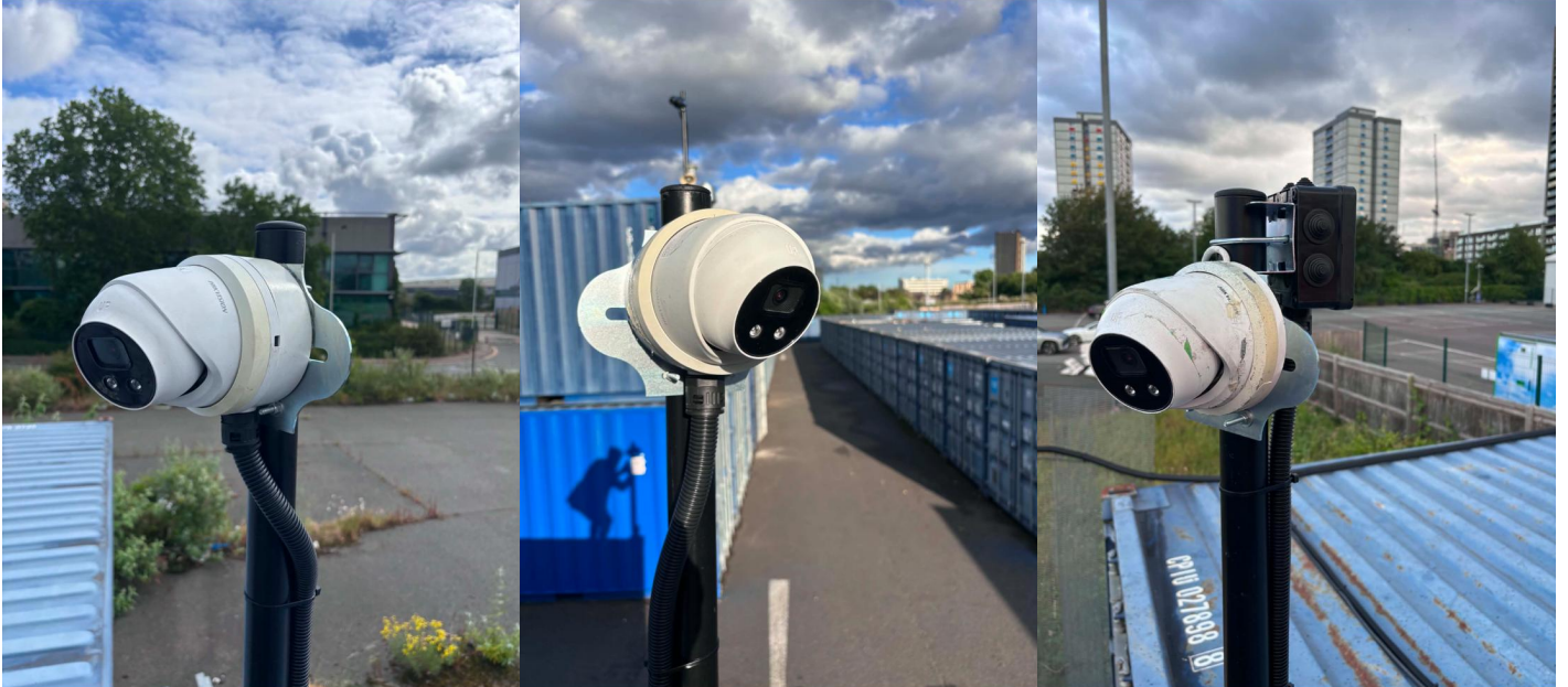
Work Image 3