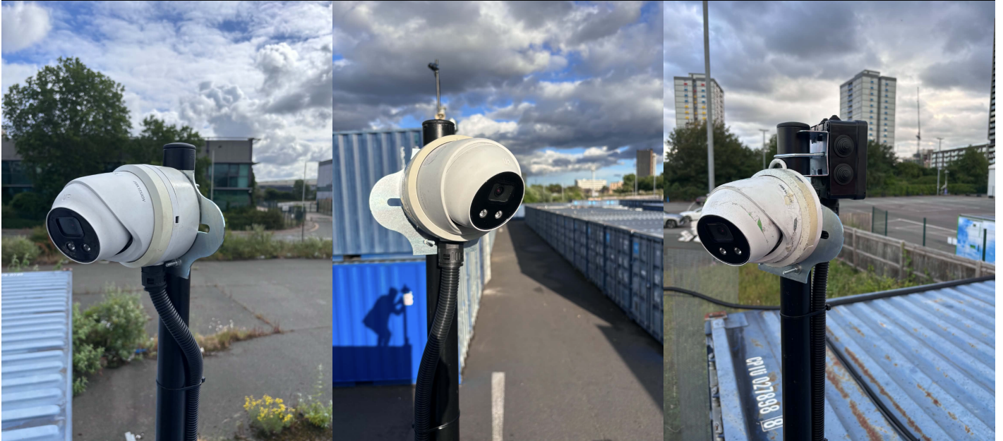
Work Image 3