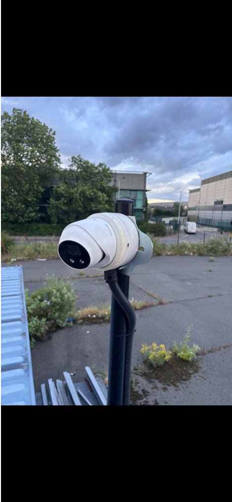
Work Image 4