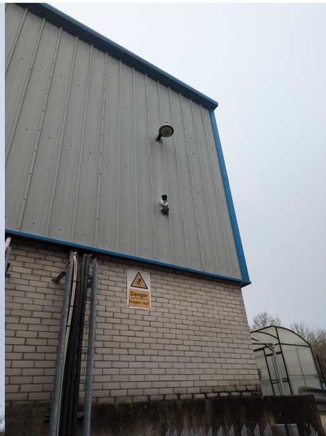
Camera Location Image 2