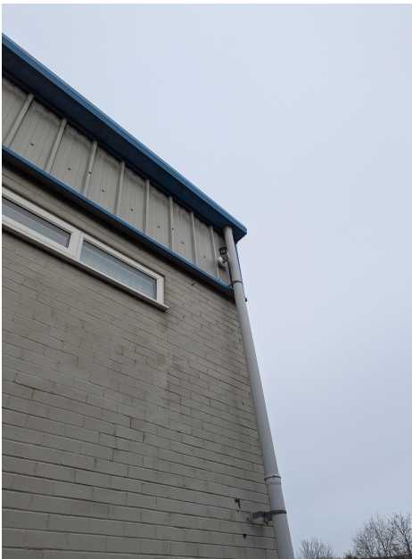
Camera Location Image 1