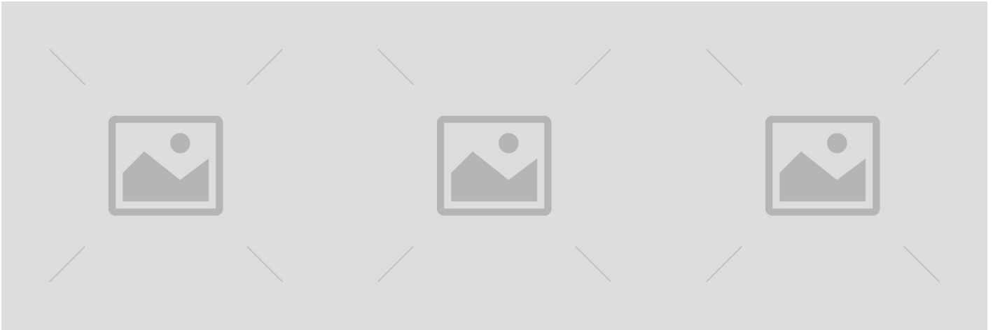
Camera Location Image 6