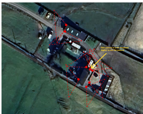
Camera Location Image 1