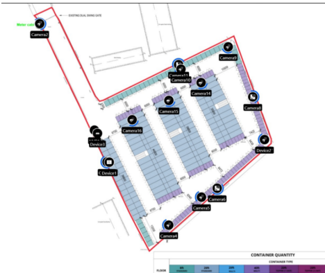
Camera Location Image 1