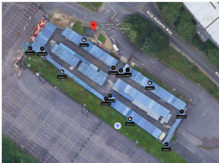
Camera Location Image 1