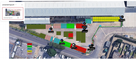
Camera Location Image 1